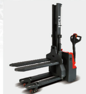
With double decker ,mast lift 1000kgs and support arm lift 1000kgs, total load is 1000kgs if use double pallet.