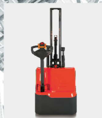
Mast with excellent visibility for wide view of the forks.