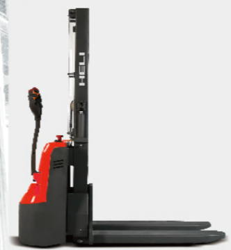
Compact design With very small turning radius, offer a range of application option in very confined space.